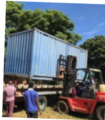
Storage container moved onto construction site