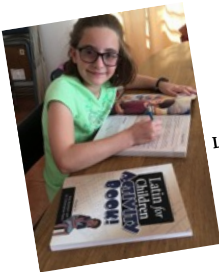
Learning Latin & loving it!