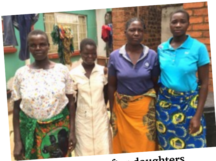
Moms rejoice after daughters are born again!